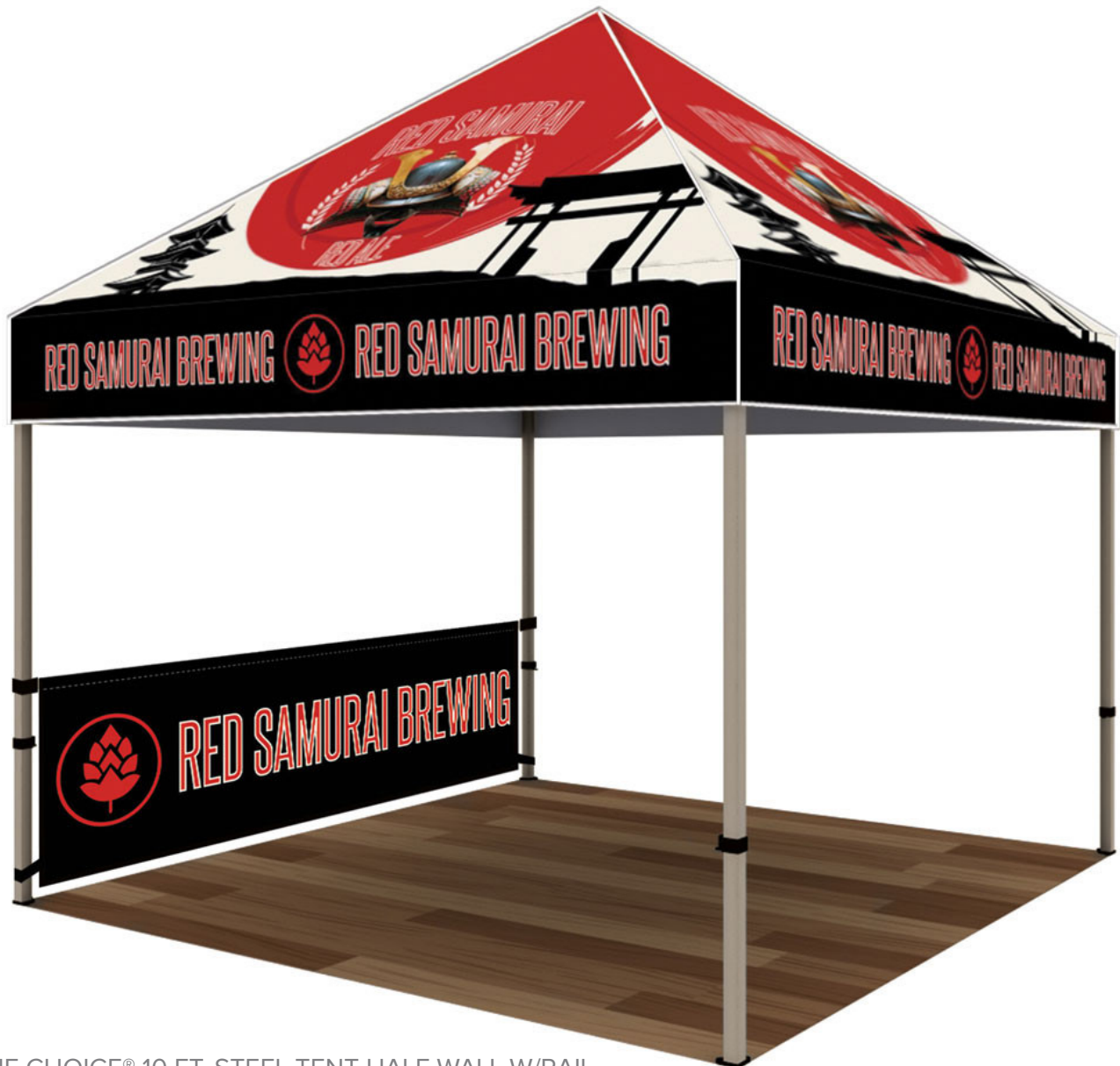
ONE CHOICE® 10 FT. STEEL TENT HALF WALL W/RAIL