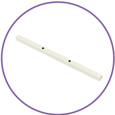
(qty 1) Rail Connector