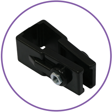
(qty 2) Rail Clamps