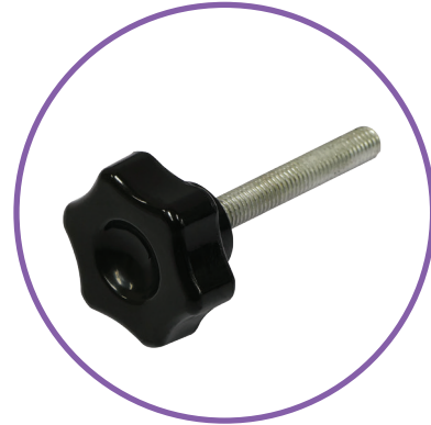
(qty 2) Rail Clamp Screw