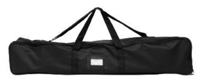
Nylon Carry Bag