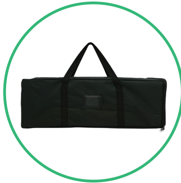
QTY 1: Black Nylon Carry Bag