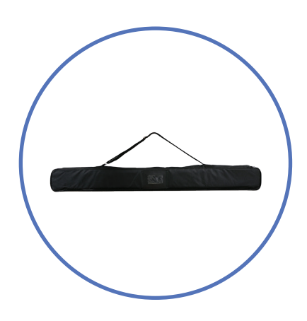
QTY 1: Travel Bag

Outside Dimensions: • 35" L x 4" W x 4" H Inside Dimensions: • 35" L x 3 1/2" W x 3 3/4" H