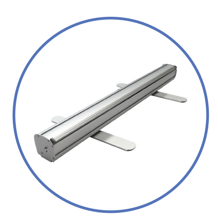
QTY 1: Good Roll Up Stand

Outside Dimensions: • 35" L x 4" W x 4" H Inside Dimensions: • 35" L x 3 1/2" W x 3 3/4" H