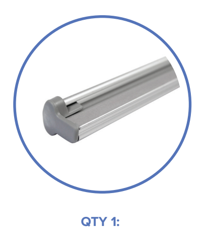
• 33 3/4" L x 1 1/2" W x 1" H

Feet NOT Expanded: • 34" L x 3 1/2" W x 3 1/2" H Feet Expanded: • 34" L x 15" W x 3 1/2" H