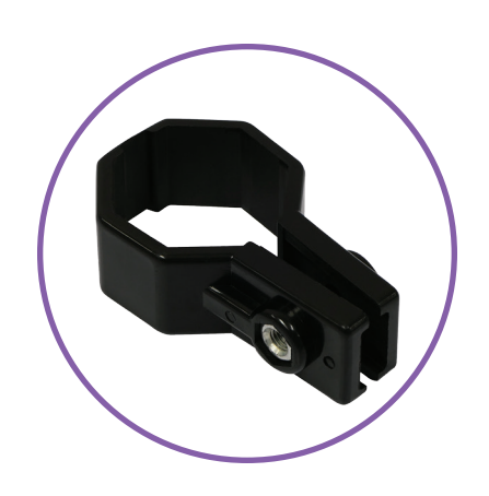
QTY 2: Rail Clamp Bar