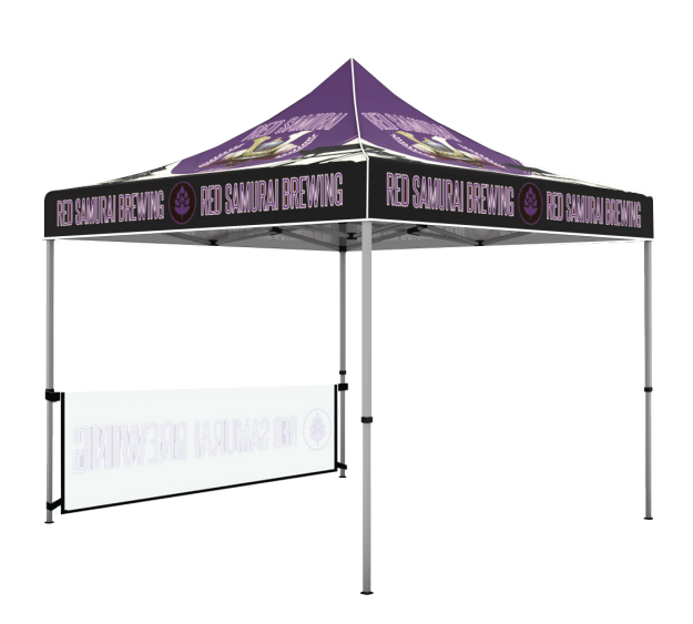
Half Side Wall Single-Sided

PRODUCT CODE: OC-CAS-1HWALLG1-1RAIL & OC-CAS-1HWALLG2-1RAIL