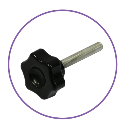
QTY 2: Rail Clamp Screw

2 1/2" L (Overall Length) 1 3/16" L (Thread Length) 1 5/8" Dia. x 3/4" H (Head Knob) 1/4" (Screw Diameter)