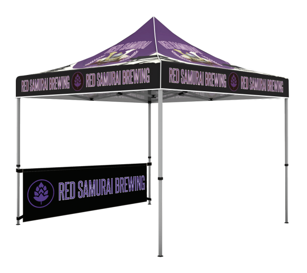
Half Side Wall Double-Sided