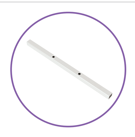
QTY 1: Rail Center Connector

2 1/2" L (Overall Length) 1 3/16" L (Thread Length) 1 5/8" Dia. x 3/4" H (Head Knob) 1/4" (Screw Diameter)